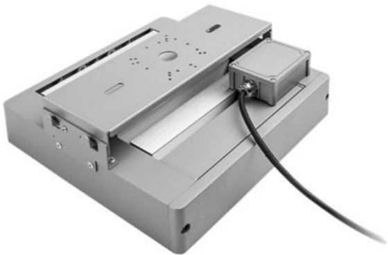
APT Power Supply (156w shown)