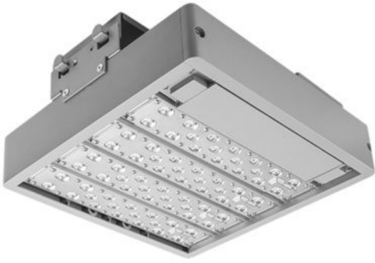
APT A Canopy Mount Bracket (156w shown)