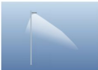
Light distribution without Back Light Shield