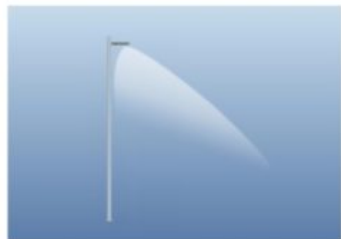
Light distribution with Back Light Shield