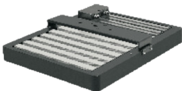
D Type Mounting