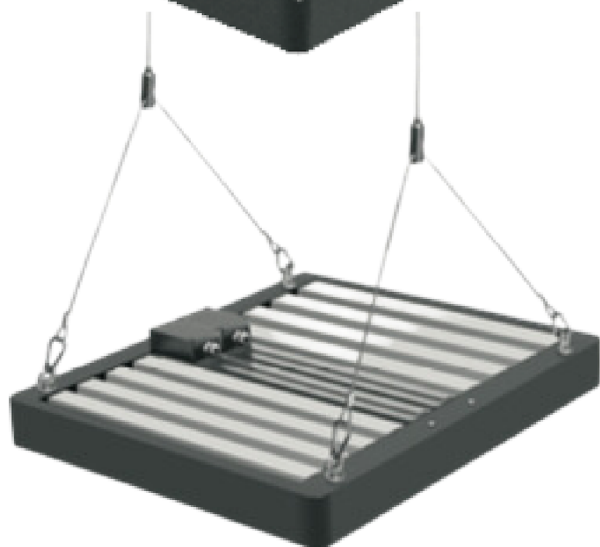
H Type Mounting