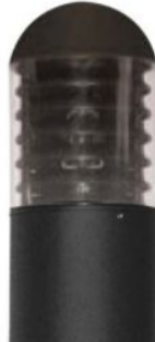
Round Dome Top