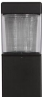
Square Flat Top