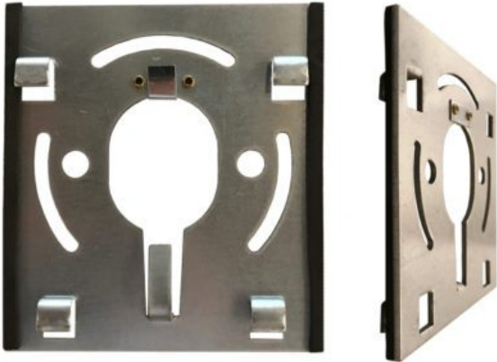
Optional Hinged Quick-Mount (2 views)