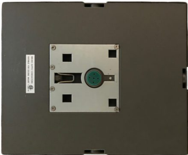
Garage Lighter (back shown with built-in Easy-Hang bracket)