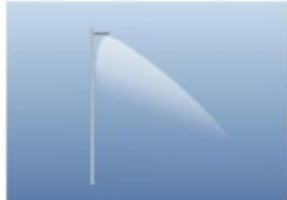
Light distribution with Back Light Shield