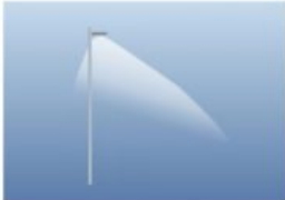
Light distribution without Back Light Shield