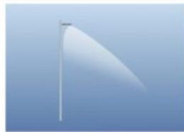
Light distribution with Back Light Shield