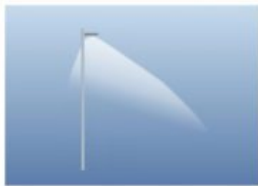
Light distribution without Back Light Shield